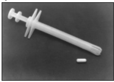
Plastic Pilling Gun with Size 3 Capsule

Closing the cat's mouth and stroking the throat will induce swallowing.