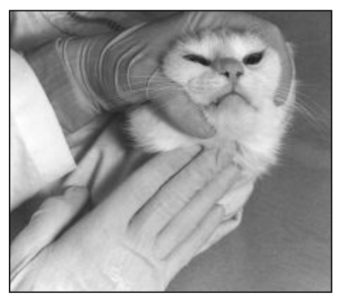
Stroking To Facilitate Swallowing