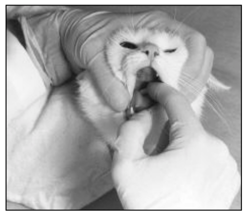
Capsule Dosing via Hand Pilling Method