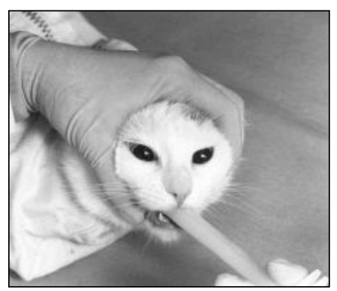
Capsule Dosing via Pilling Gun